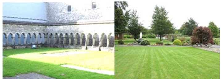
At left is the 1286 cloister where friars walked and reflected, and at right is the one where we prayed in 2016, 730 years later.

I would like to share some dates, and names with you that explain where I was last week. In 1226, St. Francis of Assisi, my patron saint, was called to his reward. About twenty years later, some Franciscans showed up in Ennis, Co. Clare, Ireland. My ancestor, Donagh O'Brien, King of Thomond, took a liking to them and built a small Friary for them near his castle before he died in 1246, twenty years after St. Francis. By 1286, sixty years after St. Francis's death, the Friary had grown and Donagh's great-grandson, Turlogh O'Brien, another ancestor, who died in 1306, had