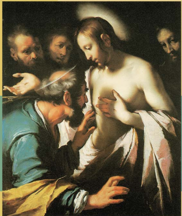
Cover design ©Liturgical Publications Inc. Image of Doubting Thomas by Bernardo Strozzi © 2007 by Dover Publications, Inc.