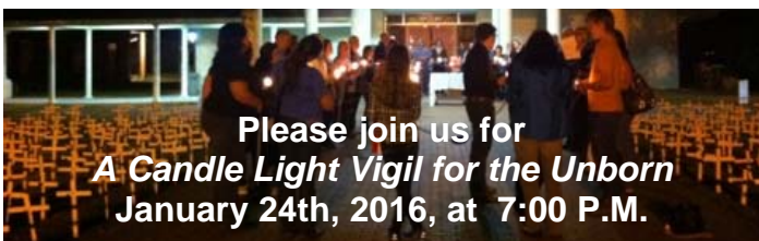
Please join us for A Candle Light Vigil for the Unborn January 24th, 2016, at 7:00 P.M.

The 12 noon hour on Fridays ( not silent ) is for priests, religious, seminarians and The Unborn . All are welcome!