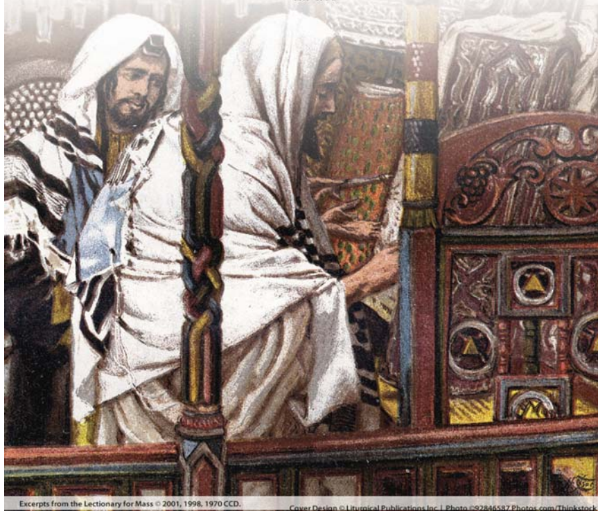
Excerpts from the Lectionary for Mass © 2001, 1998, 1970 CCD.

The Spirit of the Lord is upon me... He has sent me to proclaim liberty to captives and recovery of sight to the blind, to let the oppressed go free. — Lk 4:18